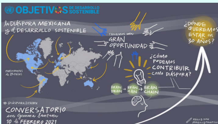
Image 2. Diaspora Mexicana Conversatorio

With 12 million people away from their homeland, Mexico has the second largest diaspora in the world. Diáspora2030mx is an online platform that brings to light how some individuals from the Mexican diaspora contribute to advance sustainable development, and the potential they have to do it for their country of origin. Through virtual conversations and simultaneous graphic recording, Diáspora2030mx aims to engage the human capital Mexico has spread across the globe to inspire, build collective knowledge, and enhance partnerships for sustainable development. Since its launch in February 2021 until December 2022, Diáspora2030mx has already hosted six discussion groups that connected 327 participants joining from 35 different countries and territories.