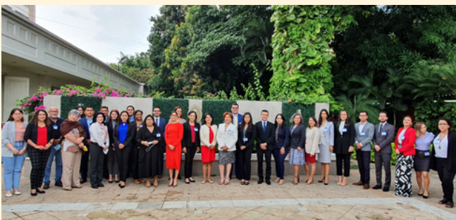
Image 3. The RCM delegation traveled to La Union to learn about the development projects

One of the most reiterated reflections in this space was that generating relationships of trust is a long-term process; it involves recognizing the heterogeneity of diasporas, incorporating a protection and human rights-based approach. In building trust, there are fundamental pillars such as transparency and the adequate access to quality services for diasporas through digitizing services and access to legal identity documents. ●