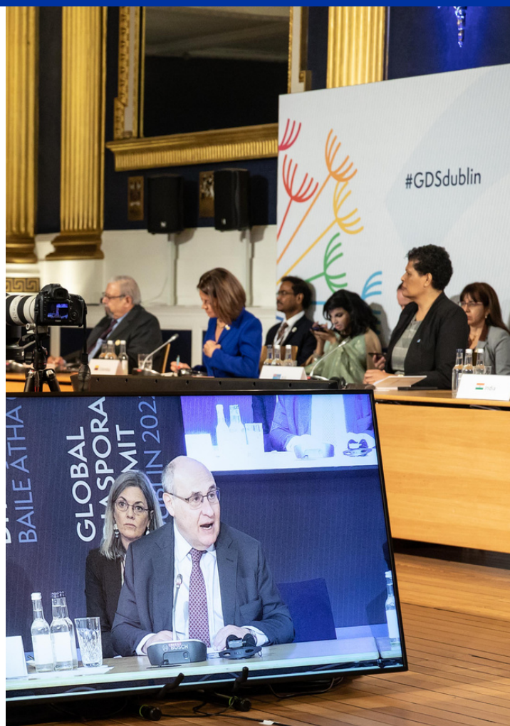
Image 1. Opening Ceremony Global Diaspora Summit 2022

If you are a government or organization who would like to give your support to the Dublin Declaration, please let us know by emailing: globaldiasporasummit2022@iom.int .