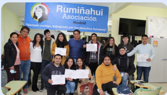
Workshop on the production of short films

Founded in 1997 by a group of Ecuadorians and Spaniards in Madrid, Spain, Rumiñahui is a non-profit organization that defends and vindicates the rights of migrants. It supports them in their integration process, contributing to improving their quality of life, as well as their family's situation and environment. These actions are based on solidarity and the pursuit of equal opportunities from legal, socio-cultural, and psychosocial perspectives. Considered an important player in civil society, both domestically and internationally, Rumiñahui collaborates with various social movements in the promotion of human rights and sustainable development, recognizing the importance of plurinational and multiethnic societies. More information here .