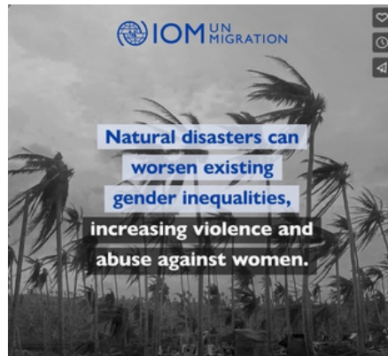
One of the 'statistics' assets on Gender-Based Violence (GBV)

We partnered with Meta's Data for Good team to develop a dual campaign to test social media strategies' efficacy. The theme was 'the impact of safe shelter on women and girls in the Philippines', and addressed different dimensions of having and not having safe shelter, including: education, gender-based violence (GBV), severity of natural disasters, and more. To facilitate these important campaigns, Meta donated $80,000 in ad credits towards this nonprofit, nonpartisan social issues campaign.